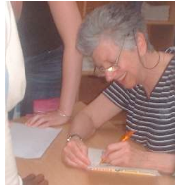
Beverley Naidoo signing books during her visit to the school

'I loved meeting the children at Woodberry Down and experiencing their enthusiasm about reading a story that reflected something of the world they know. The quality of their work around The Other Side of Truth is outstanding! The way the children have engaged with the novel so creatively and thoughtfully is also a tribute to the way their teachers have 'led' them into the story through such a lively cross-curricular approach. How I would have loved to join them on their 'detective' journey from Victoria Station to the 'London College of Art' on the Number 36 Bus! Perhaps that will also have inspired new stories of their own... as indeed any bus journey can if you listen and look carefully enough. Many congratulations to readers and writers, young and old, at Woodberry Down... and let's continue to read and write the world!'