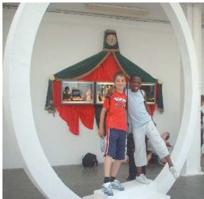
At Camberwell College of Art